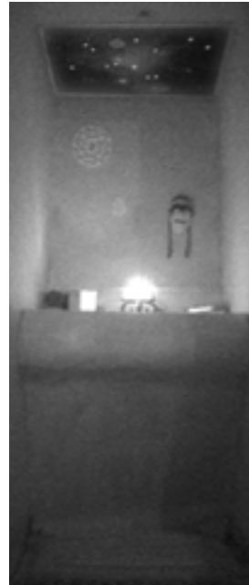
Figure 1. Altar niche.